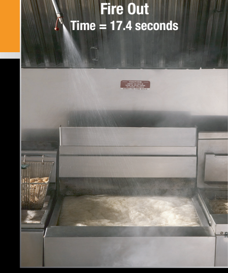
Protect with the best and install for less